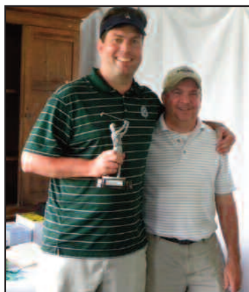
Longest Drive and Closest to the Pin