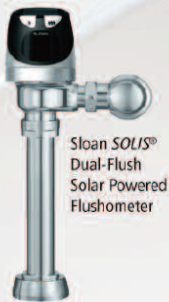
Sloan SOLIS® Dual-Flush Solar Powered Flushometer