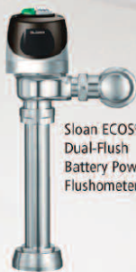
Sloan ECOS® Dual-Flush Battery Powered Flushometer